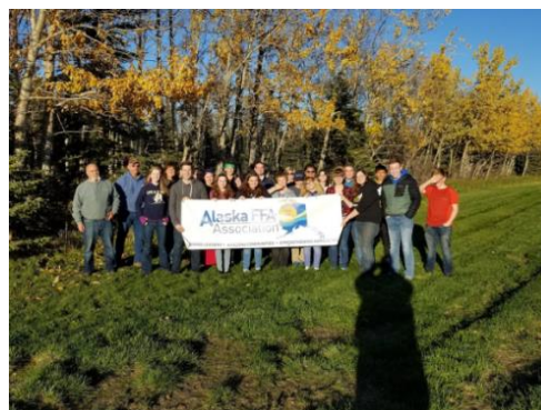
Interior D.L.S at Fort Greely