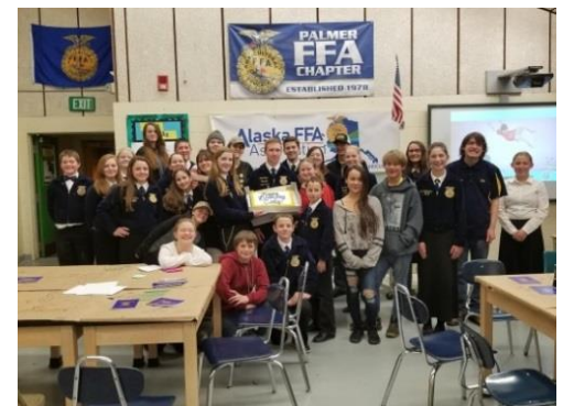
MatSu D.L.S. at Palmer