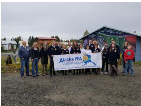
Kenai D.L.S at Ninilchik

Farm Bureau's continued support with their educational grants helped us to host fall District Leadership Schools (DLS) across the state. These two day events were devoted to leadership workshops for local chapters and a second day concentrating on Natural Resource education, including soils, GPS, wildlife and ecology. Twelve chapters had members represented at these events.